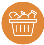
Retail and Consumer Products Impacts