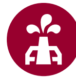
Natural Resources Impacts