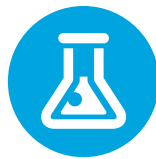
Life Sciences Impacts